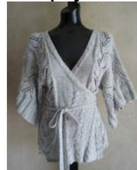
#69 Cables and Lace Kimono Wrap Cardigan

Visit www.SweaterBabe.com for the complete selection of Knitting Patterns, including the latest FREE patterns.