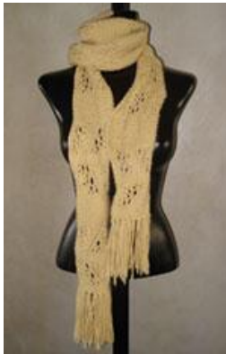
#68 Sinuously Curved Lace Scarf

Other SweaterBabe.com patterns you may like for your next project. . .