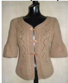
#70 Lush and Lacy Cardigan